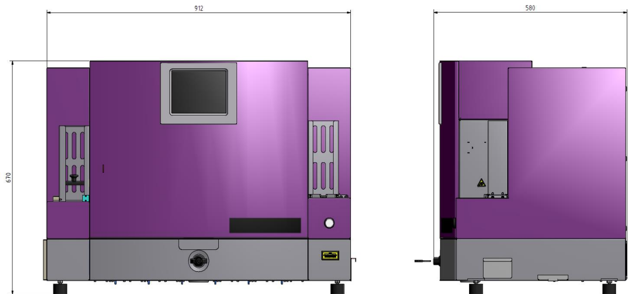
Figure 1: outer dimensions of CardMaster Desk System